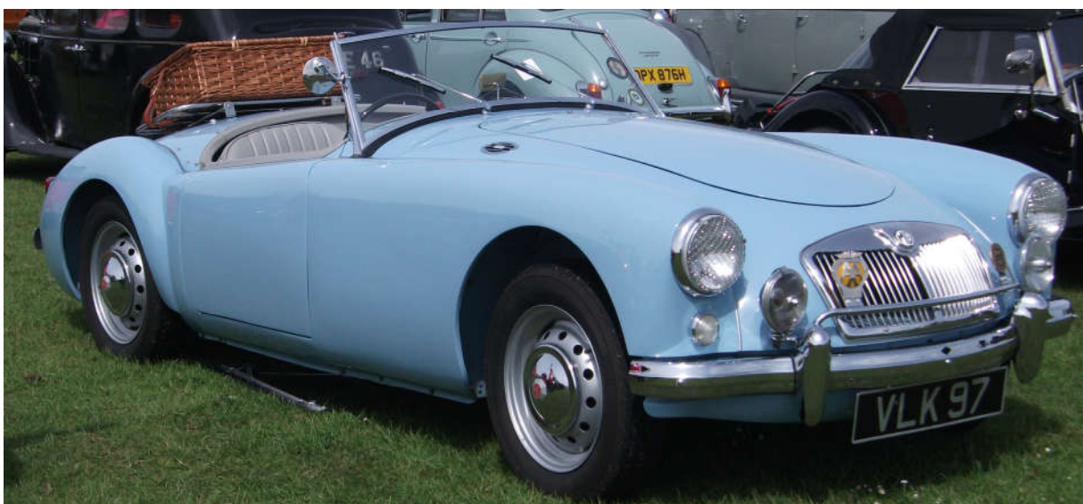
My favourite from the Rally