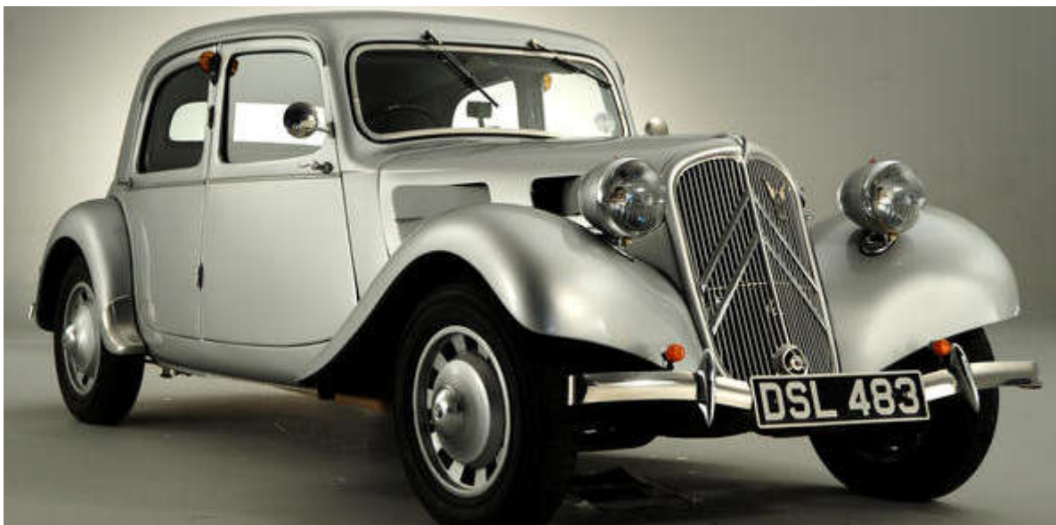
UK Registered Citroen Traction Avant as seen on t'internet. Ed.